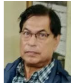
Sergt. At Arms