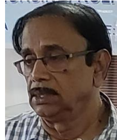
Public Image Chair