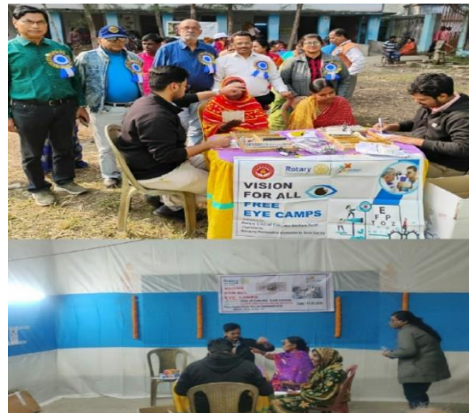
VISION FOR ALL FREE EYE CHECKUP CAMP WITH FREE SPECTACLES AND FREE CATARACT SURGERY ON 11 TH JANUARY 2025 THROUGH ROTARY CLUB OF CALCUTTA AT RCC SONARTARI WOMEN & CHILD WELFARE INSTITUTION BALIKA KALIA ADARSH VIDYAMANDIR, KULP SOUTH 24 PARGANAS BENEFICIARIES: 250, ROTARIANS: 5, MANHOURS: 20, COST: 10000