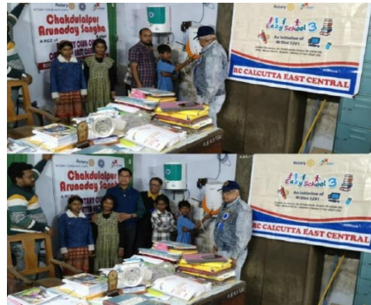
INAUGURATION OF WATER FILTER MACHINE DONATED AND INSTALLED AT KARANJALI BK INSTITUTION THROUGH OUR RCC CHALKDULALPUR ARUNADAY SANGHA, KULPI, SOUTH 24 PARGANAS ON 11 TH JANUARY 2025 BENEFICIARIES:200, ROTARIANS: 5, MANHOURS: 10, COST: 20000